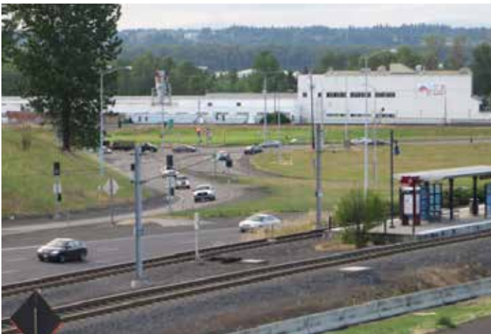
The I-205 onramp as seen from the Sandy Blvd overpass across the MAX station