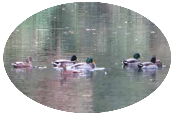
Ducks enjoying a day on Johnson Lake.