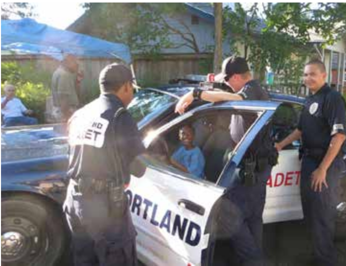
Portland Police Cadets let a youngster sit inside their fancy car